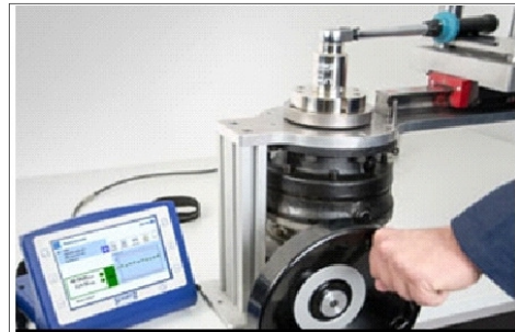
A hand crank mechanism is used to apply the torque for testing a handheld torque wrench.

Test procedures to determine measurement uncertainty and calibration intervals are specified in the ISO 6789 standard.