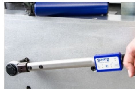
The torque is measured when the bolt starts turning. The process analysis is determined by the turn-further-torque and break-away torque.

The retightening torque is measured to check whether the interaction between the driver, the bolt or nut and the bolted parts has yielded the desired result. Process capability testing represents the cumulative effect of a series of factors that play a role in the quality of bolted joints. Proof of process capability is the final stage in ensuring reliable bolt assembly.