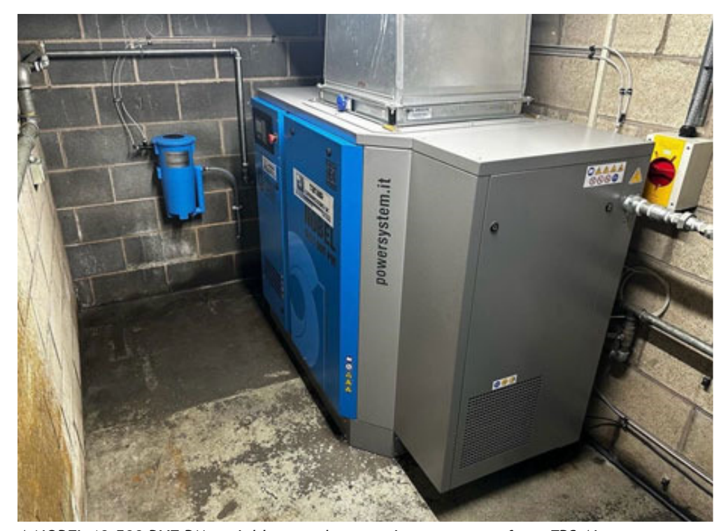
A NOBEL 18.508 DVF PM variable-speed screw air compressor from FPS Air Compressors systems has seen a 46% reduction in compressor energy consumption at Armac Martin.

Word Count: Approximately 600 words (including photographic annotations)