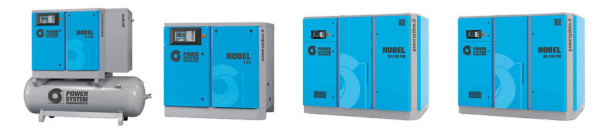
The new NOBEL variable-speed screw air compressor range from FPS Air Compressors.

<u>Download high resolution 300dpi image</u> <u>Download low resolution 72dpi image</u>