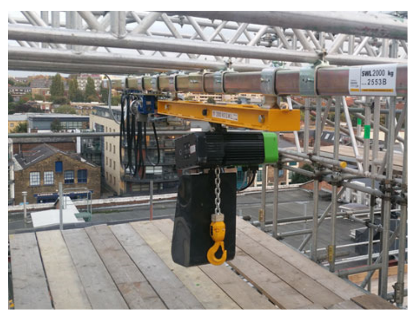
Typical Hoist and Winch project - a 2000 kg Swl Single fall hoist incorporated onto a special scaffold structure and used in the refurbishment of a five storey building in central London.

Download high resolution 300dpi image Download low resolution 72dpi image