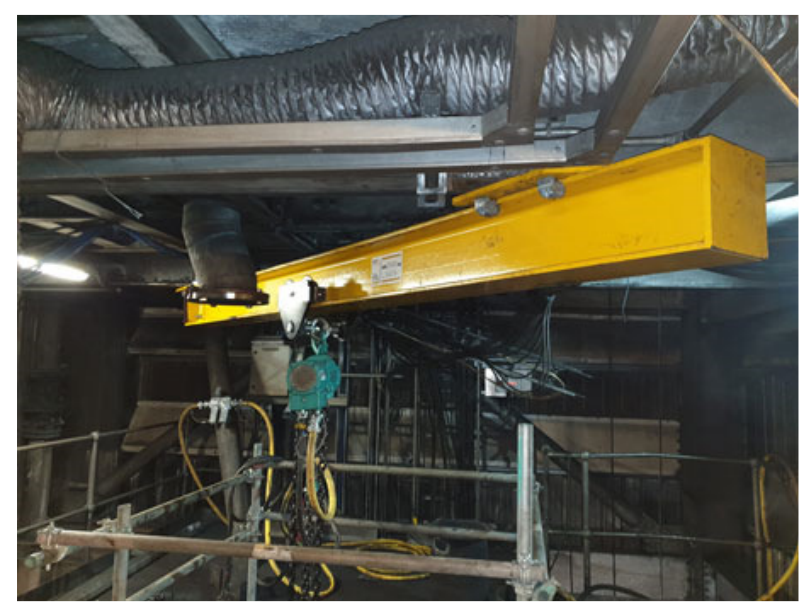
A strong Hoist and Winch business area is hoist hire, including higher capacity air/electric hoists, shown here a 5t air hoist.

Download high resolution 300dpi image Download low resolution 72dpi image