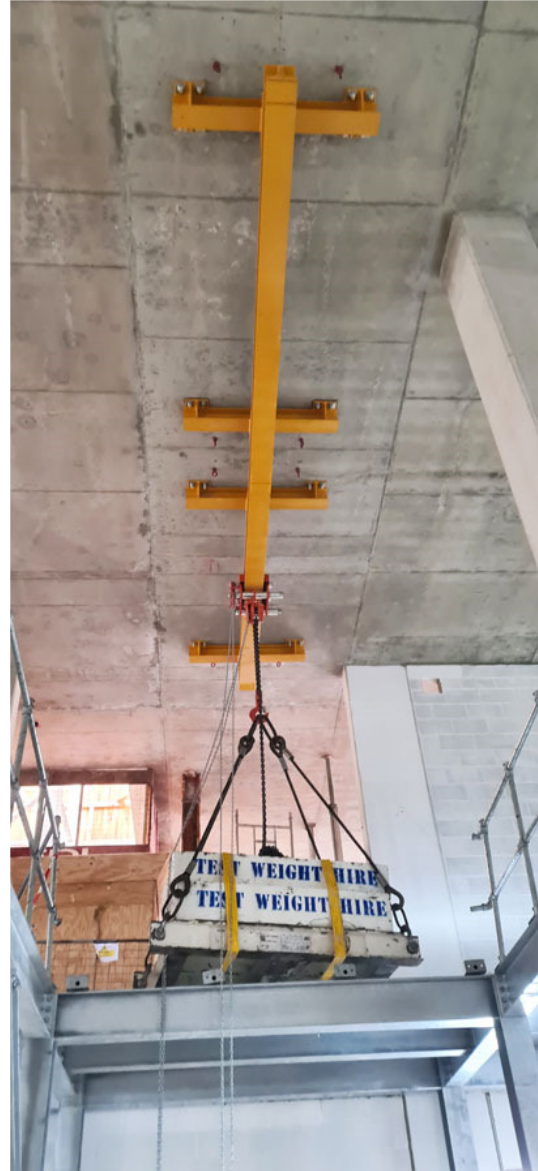
The lifting beam fully raised and undertaking load testing.