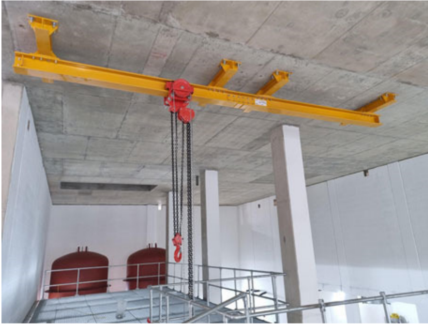
Concrete ceiling mounted 7.5t swl lifting beam and manual chain hoist recently installed by Hoist & Winch Ltd into the basement energy room of a large new tower block.