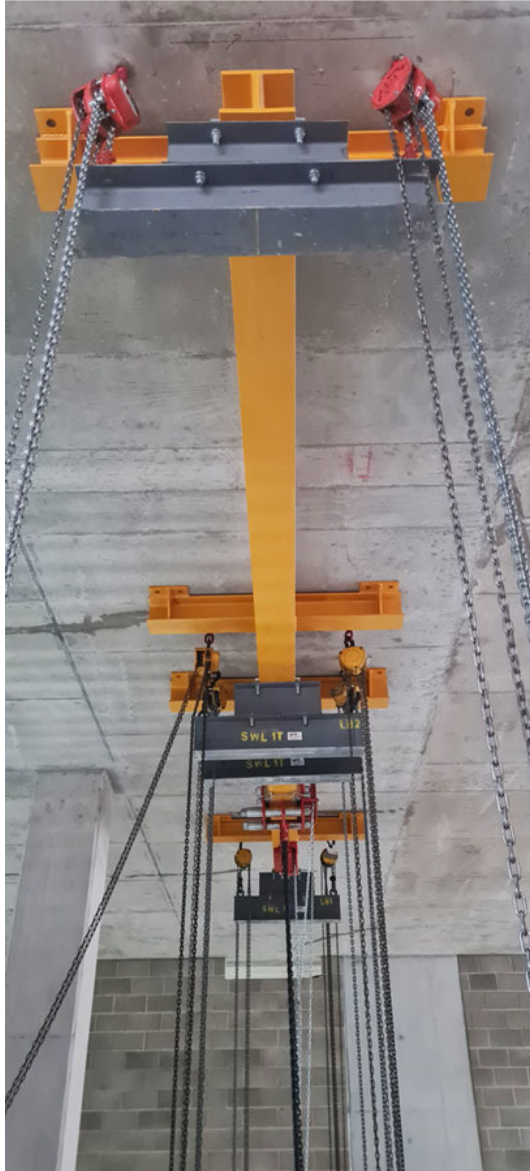
The lifting beam fully raised and joined.