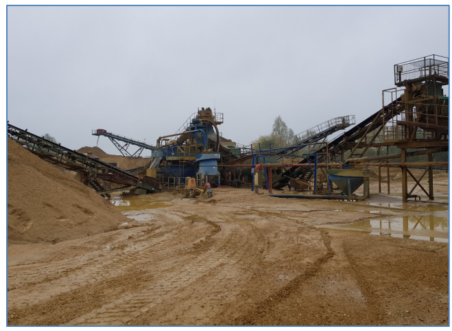
Caption: Hills Quarry Products was experiencing costly pump failures every two weeks at its sand and gravel quarry in Cerney Wick, Gloucestershire